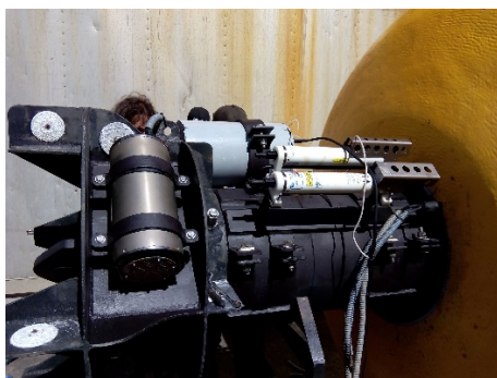
Sensor installed below a buoy